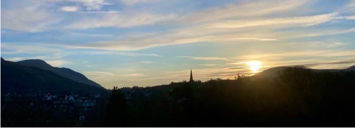
Easter Sunrise over Keswick