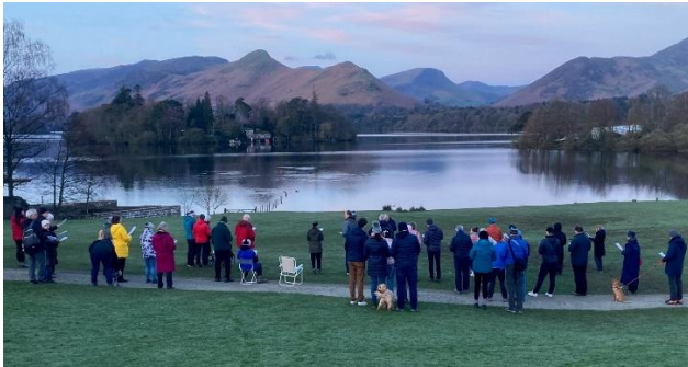
Churches Together Sunrise Service