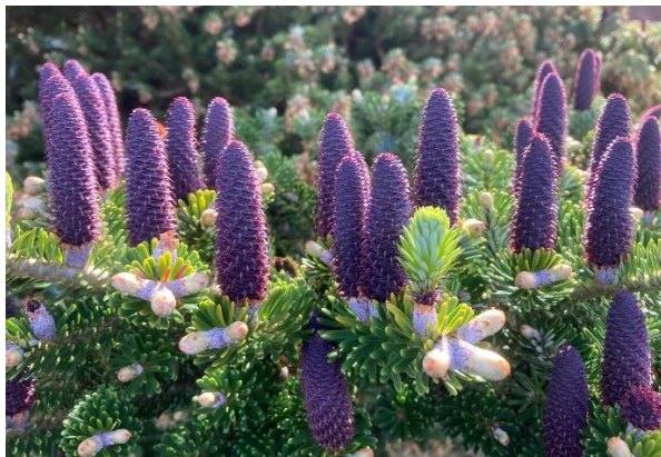
A photo of a Korean Fir – taken in Cheshire